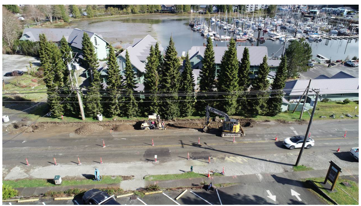
Photo #3 – Old Storm Pipe (CSP) Removed (Along North Side of Road)