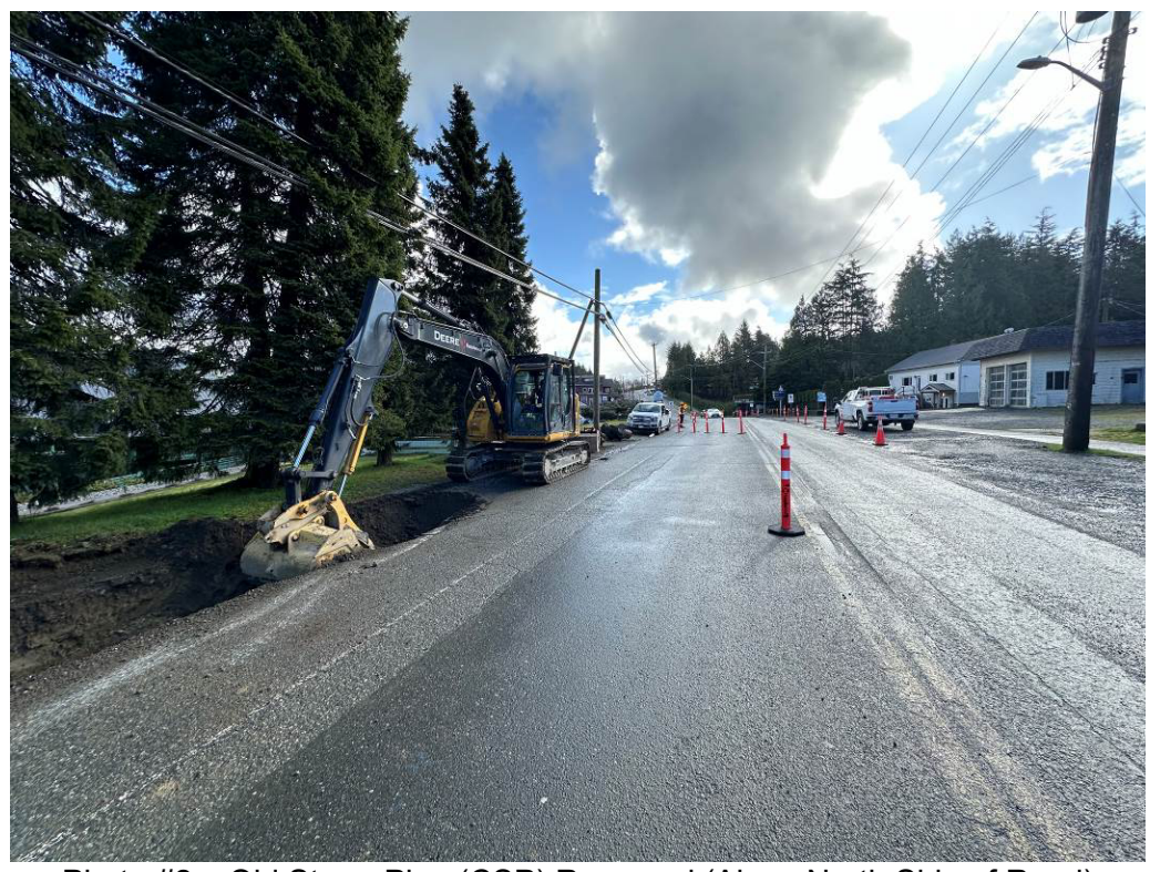
Photo #2 – Old Storm Pipe (CSP) Removed (Along North Side of Road)