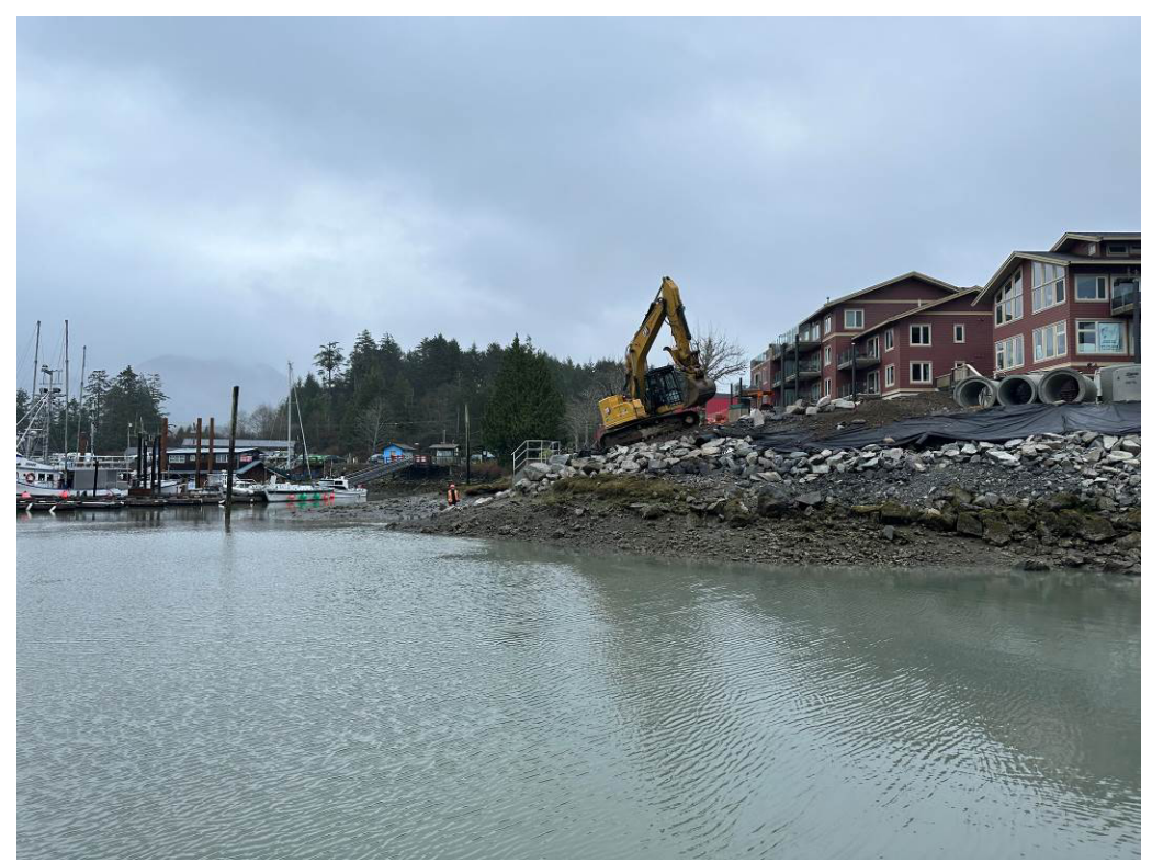
Photo #5 – Final Rip Rap Placement at Outfall completed during low tide (with environmental monitor onsite)