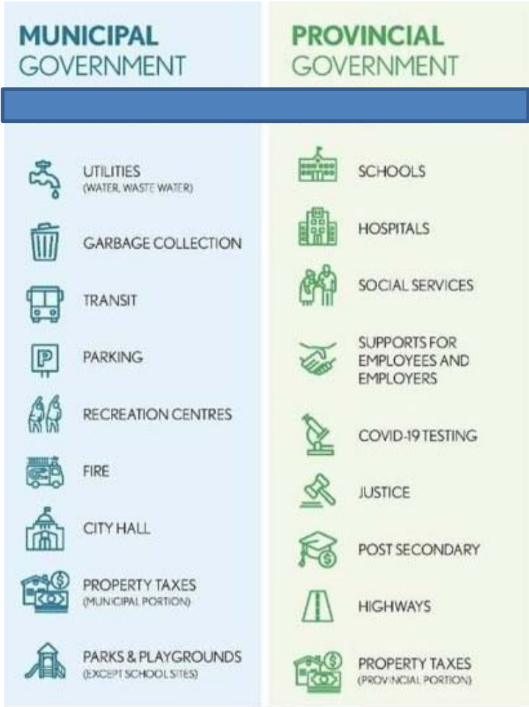
Adapted from City of Beaumont, AB