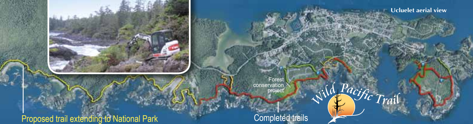
Ucluelet aerial view