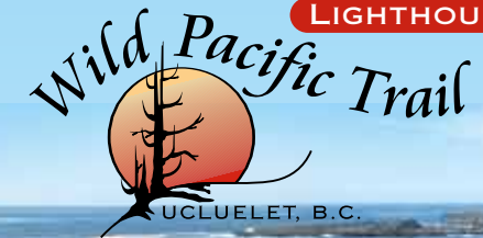
Panoramic views near the lighthouse

2 km 1.5 km 1 km .5 km 0 km Start of trail 2.6 km loop 45-60 minutes + view stops Amphitrite LIGHTHOUSE Barkley Sound