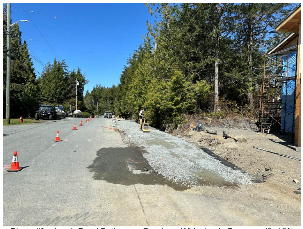
Photo #2 – Larch Road Pathway – Roadway Widening in Progress (5+150)