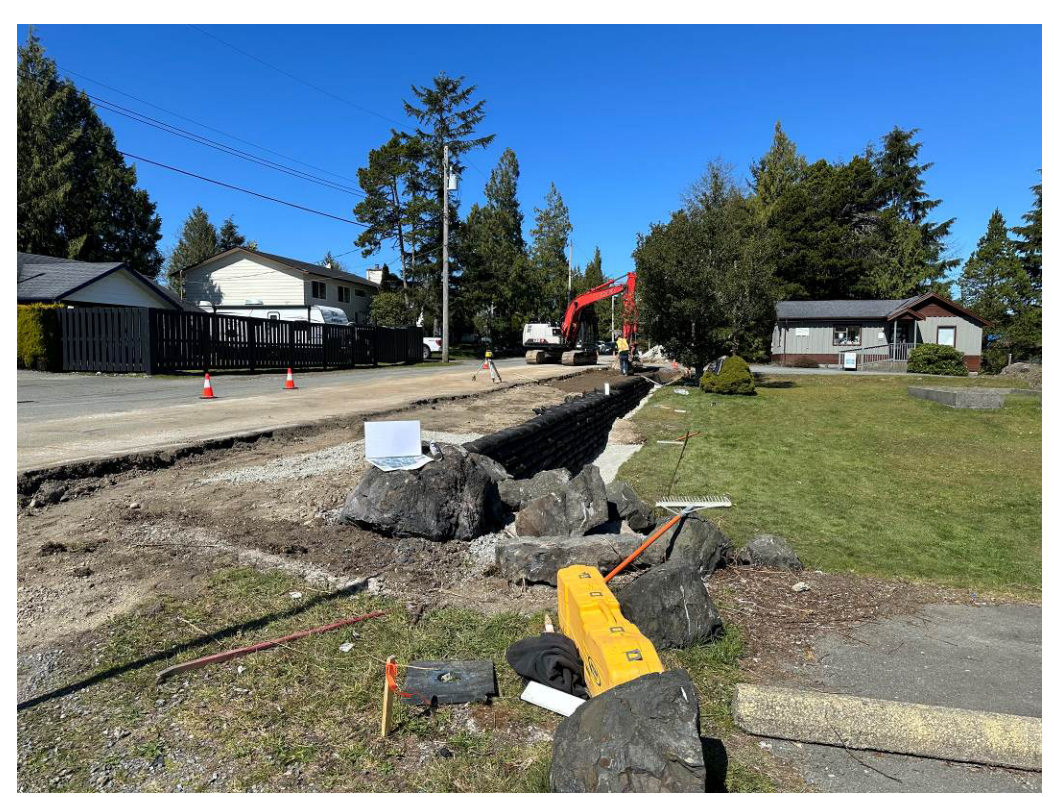
Photo #1 – Larch Road Pathway – Roadway Widening in Progress (5+300)