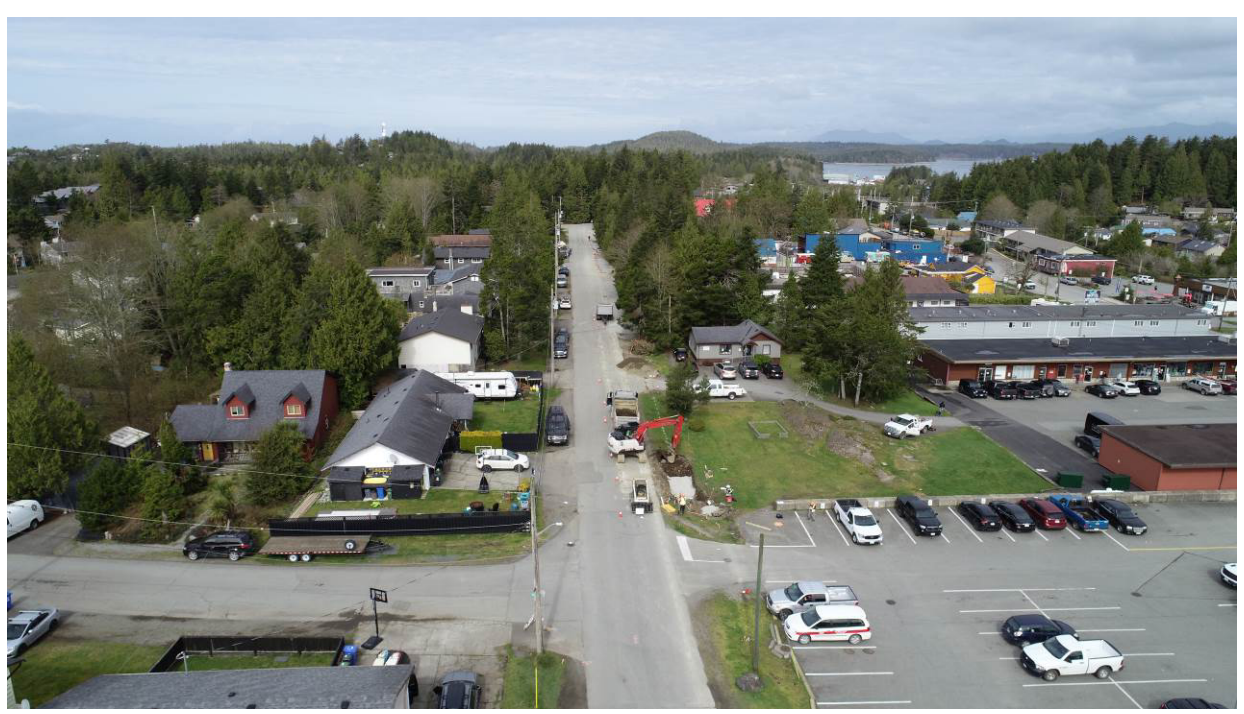
Photo #5 – Larch Road Pathway – Roadway Widening in Progress (5+300)