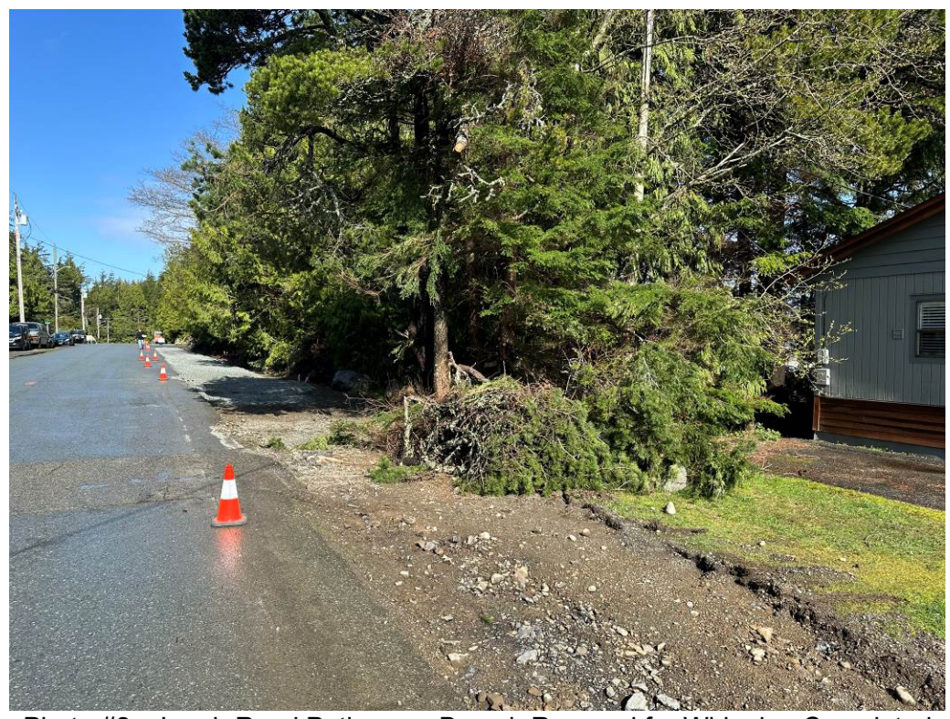
Photo #2 - Larch Road Pathway - Branch Removal for Widening Completed