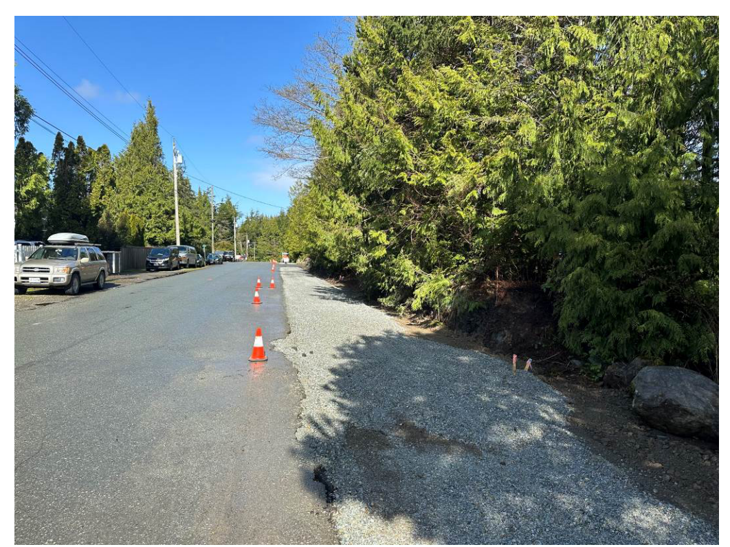
Photo #1 – Larch Road Pathway – Roadway Widening in Progress (5+200)