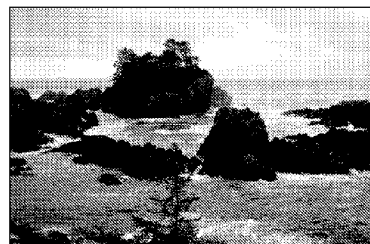
The Wild Pacific Trail offers incredible views of the Barclay Sound, the Broken Group Islands and the open Pacific Ocean.

Ucluelet and the surrounding area celebrate the whales' return with the week-long Pacific Rim Whale Festival, also in March. Local whale-watching tour operators in Ucluelet take visitors out to see the whales throughout the season. But a hike along the Wild Pacific Trail may also bring sightings.